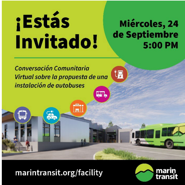
Invitation to Community Open House (July 2025)

Image posted to Marin Transit social media sites on Facility outreach event (September 2025)